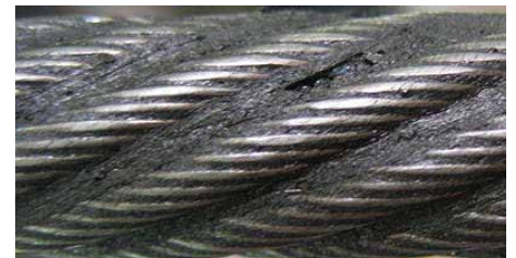
Left Lay - Counter Clockwise Rotation

Seals, Scrapers and Rope Cleaners should be selected using the Viper Seal - Scraper - VRC guide on page 4