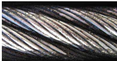
Right Lay - Clockwise Rotation